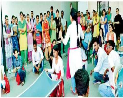
जीव. सीआरएसयू में नुककड़ नाटक का मंचन करती कलाकार।