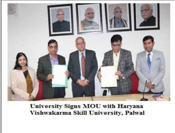
University Signs MOU with Haryana Vishwakarma Skill University, Palwal