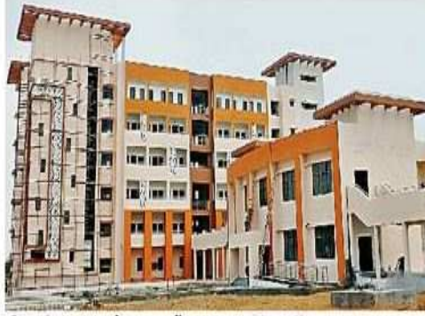
जौद. सीआरएसयू में बनकर तैयार हुआ बॉयज हॉस्टल।

गौरतलब है कि अभी तक यूनिवर्सिटी में केवल लड़कियों के लिए ही हॉस्टल की सुविधा है। लड़कों के लिए फिलहाल हॉस्टल की सुविधा नहीं है। इसके चलते दूसरे जिलों व प्रदेशों से यहां पढ़ने के लिए आने वाले विद्यार्थी मजबूरन कैम्पस से बाहर कमरा किराये पर लेकर रह रहे हैं जो काफी महंगा पड़ता है।